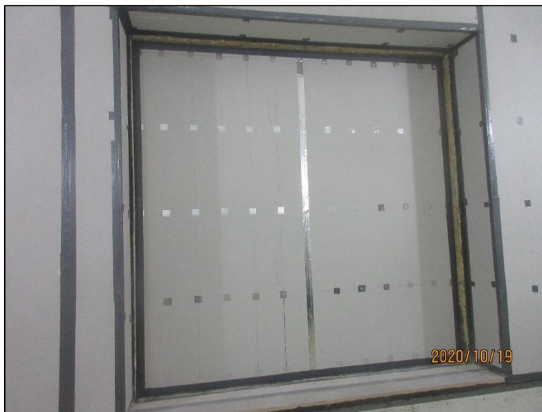
Photo No. 2 Source Room View of Installed Specimen