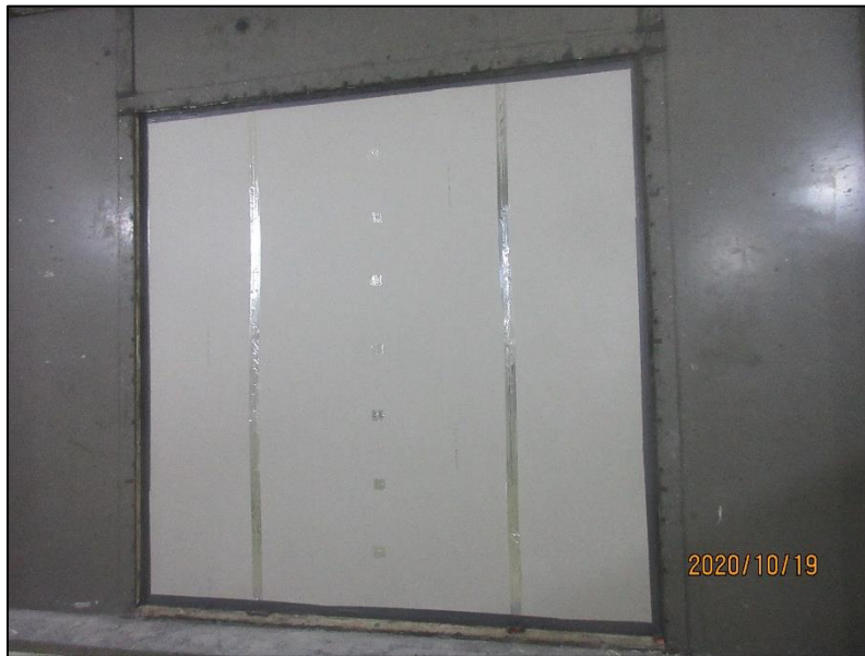
Photo No. 1 Receive Room View of Installed Specimen