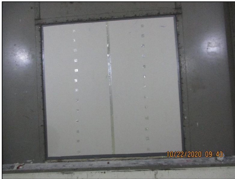
Photo No. 1 Receive Room View of Installed Specimen