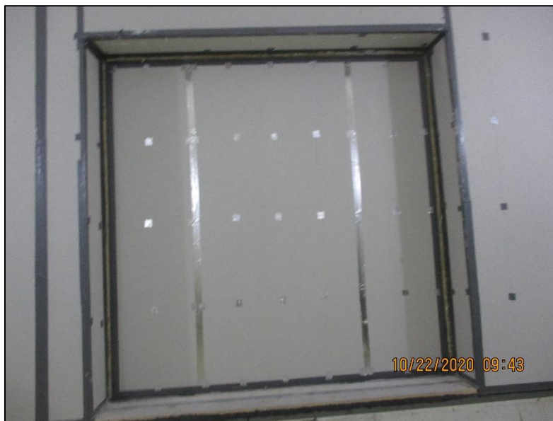
Photo No. 2 Source Room View of Installed Specimen