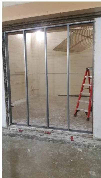
Figure 2 – Framing members installed in test aperture