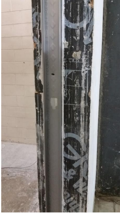
Figure 3 – Typical fastening and sealing of perimeter studs