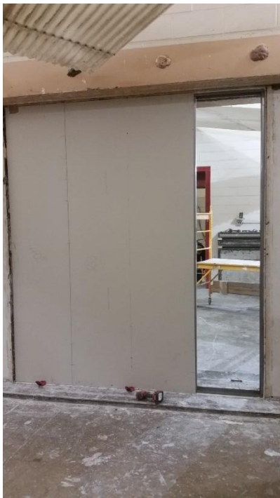
Figure 4 – Gypsum board layer partially installed