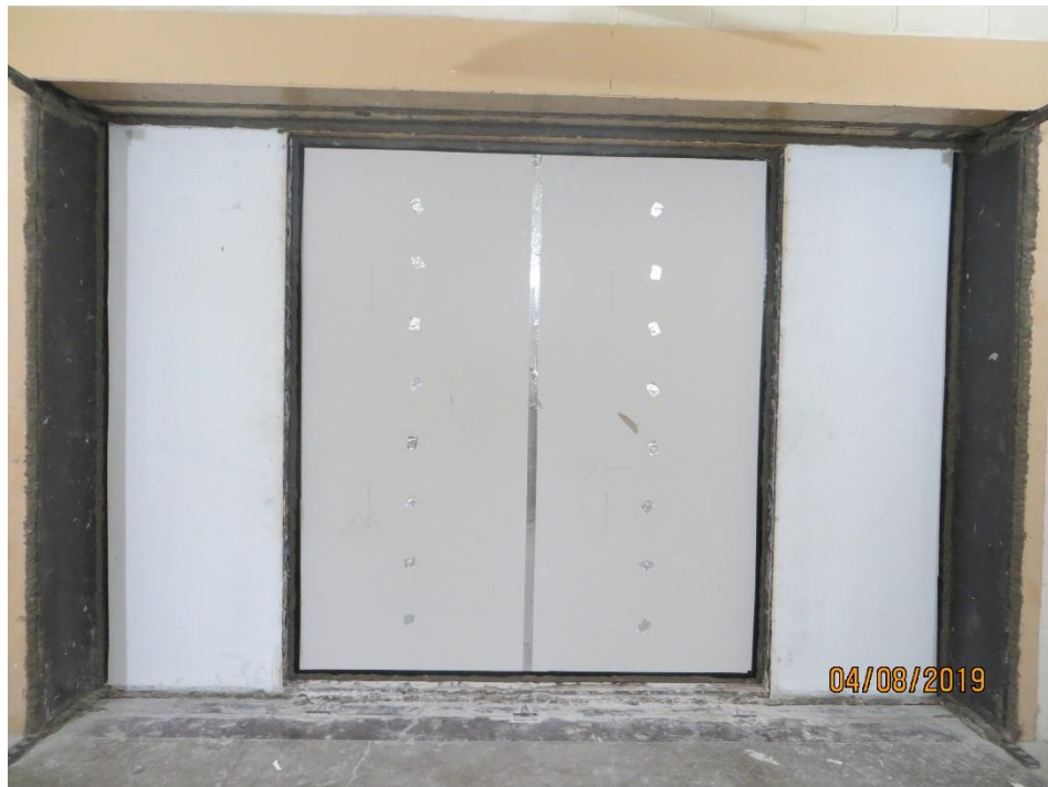
Figure 1 – Specimen mounted in test opening, as viewed from receive room